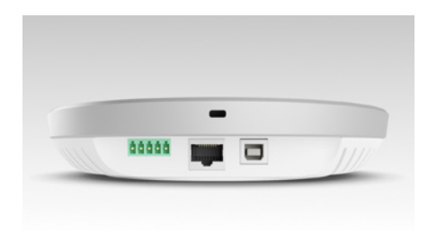
CONNECTIONS RJ45 Ethernet, RJ45 Dante (in Hub only), USB Type B, and Female Terminal Block