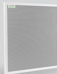
MXA920 CEILING ARRAY MICROPHONE