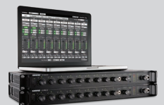
SCM820 AUTOMATIC MIXER