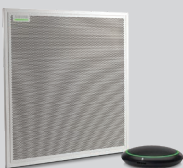
MICROFLEX® ADVANCE™ TABLE AND CEILING ARRAY MICROPHONES