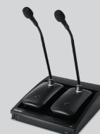
ULX-D DIGITAL WIRELESS MICROPHONE SYSTEM