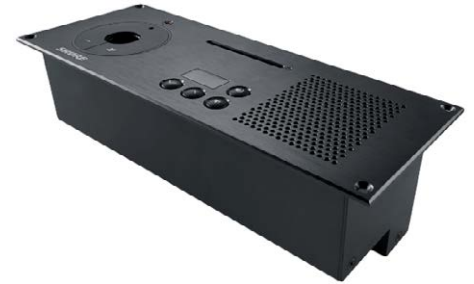
MXC620-F Conference unit